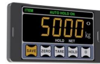
Smart phone application (Bluetooth Option)