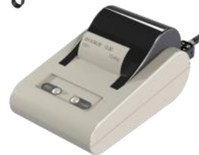
Printer / Label printer (Option)