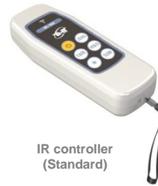
IR controller (Standard)