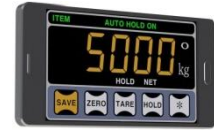
Smart phone application (Bluetooth Option)